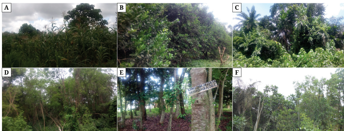
Fig. 1. Different agricultural land use types used for the study. A. Maize farm, B. Citrus grove, C. Oil palm plantation, D. Alley crop farm E. Agroforestry, F. Natural vegetation

Soil samples were collected from five agricultural land use types (Fig. 1) which included a maize farm (MF), a citrus grove (CT), an oil palm plantation (OP), an alley crop farm (AC), agroforestry (AG) and uncultivated soil under natural vegetation (NC). The description and year of establishment for each site are presented in Table 1. For each land use type, three plots of 10 m × 10 m were delineated based on observable field characteristics such as topography and vegetation types. In each plot, three replicates soil samples were collected with a soil auger at 0–15 cm soil depth using the simple random method. Each sample was a bulk of three subsamples collected within the same zone within the plot. The samples were air-dried, crushed with a porcelain mortar and pestle, and sieved through a 2 mm mesh sieve to determine the physical and chemical properties. Soil pH was measured using a WalkLAB TI9000 pH meter in a 1:10 soil water suspension. Soil organic carbon was determined by using the chromic acid oxidation method (Sato et al., 2014) and total nitrogen was determined using microKjeldahl procedure. Particle size distribution was determined by hydrometer method. Available phosphorus was determined using Bray-1 method (Beegle, 2005). In this method, soil samples are first extracted with a solution containing a mixture of Bray's solution (containing ammo-