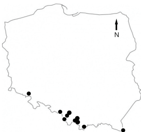
Fig. 1. Distribution of research plots in mountain region of Poland

10 study plots representing mountain areas were included in the study. Study plots were located in the mountains in the